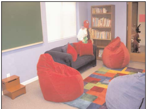
Family Tree donor, Riley Carney relaxes on a bean bag after a hard days work of transforming the group room at Family Tree Women In Crisis shelter.